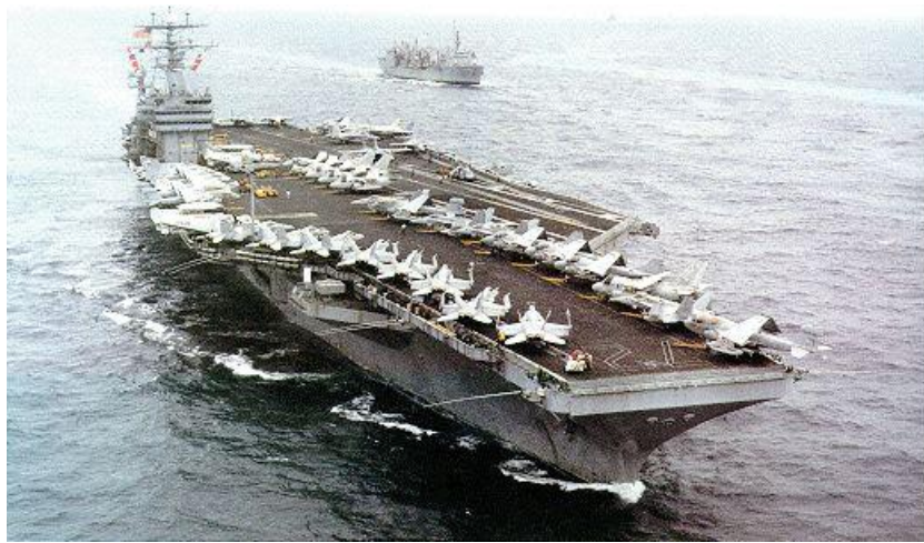
Pride of the US Navy

This is the actual radio conversation of a US naval ship with Canadian authorities off the coast of Newfoundland in October 1995. Radio conversation _____ (release) by the chief of naval operations, 10-10-95.